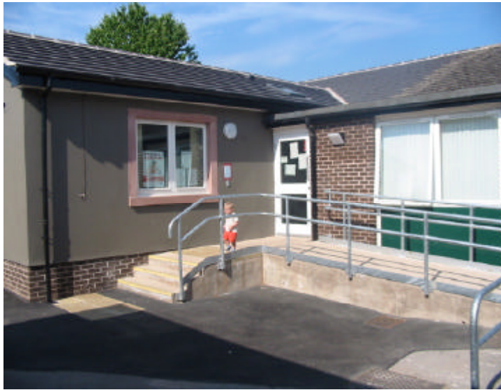
Main entrance into Pre-School & Children' s Centre (The door works on a internally placed release button system)

Kirkby Thore Pre-School is based within the children's centre which is joined onto the school. We find that a great advantage of holding the pre-school adjacent to the school is that it helps with the transition from pre-school to primary school. During their time in the pre-school the children get familiar with the building and the school staff whom they see regularly. It has its own entrance which is locked at all times and access can only be gained by ringing a bell and a member of staff releasing the door.