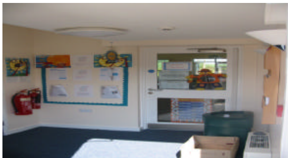
Entrance into Pre-School room

Kirkby Thore Pre-School is based within the children's centre which is joined onto the school. We find that a great advantage of holding the pre-school adjacent to the school is that it helps with the transition from pre-school to primary school. During their time in the pre-school the children get familiar with the building and the school staff whom they see regularly. It has its own entrance which is locked at all times and access can only be gained by ringing a bell and a member of staff releasing the door.