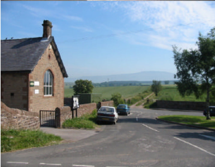
Kirkby Thore School